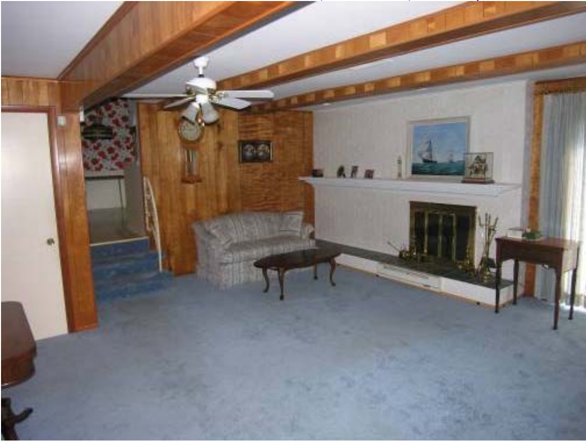
FAMILY ROOM – 16'9" X 18'10"

REAL ESTATE AUCTION – 302 FIRESIDE DR., CAMP HILL, PA – July 30 th - Noon