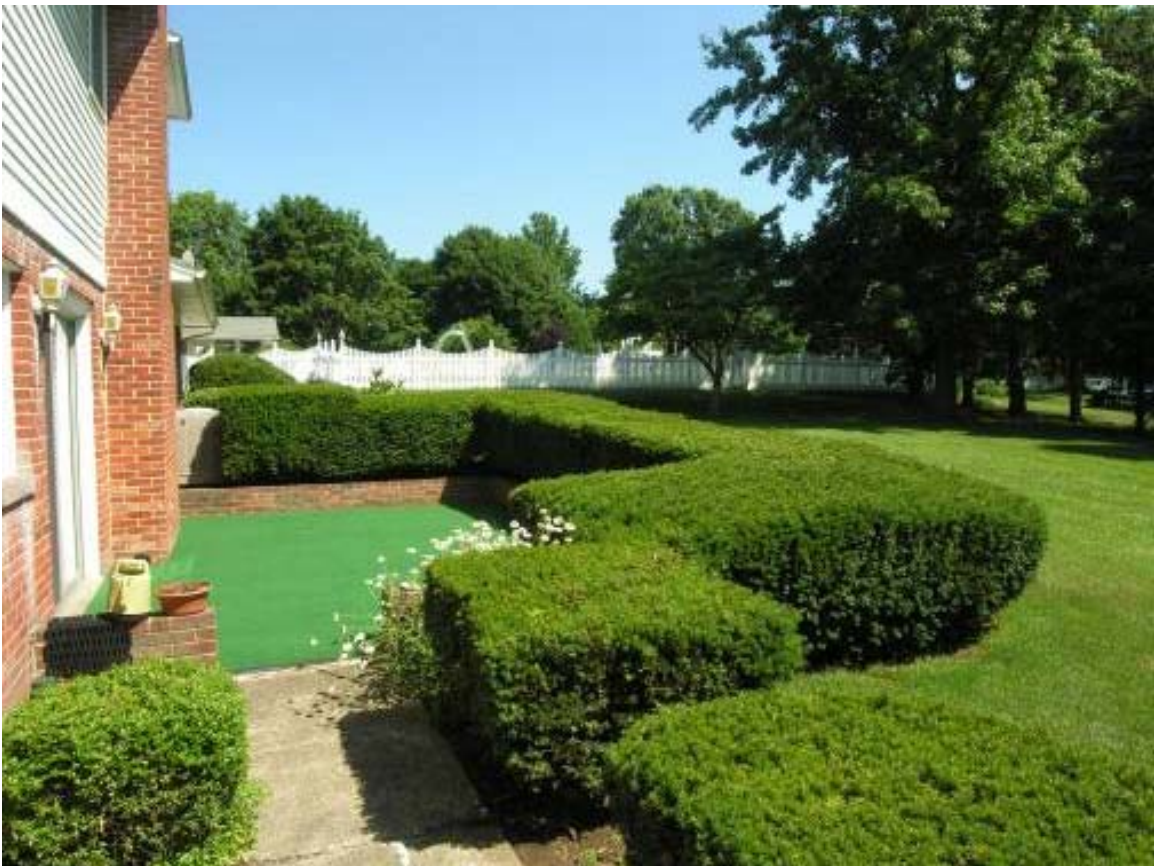
PATIO & REAR YARD

ENSMINGER AUCTIONEERS – Since 1836 – PA Lic.#RY-160-L – 717-652-4111