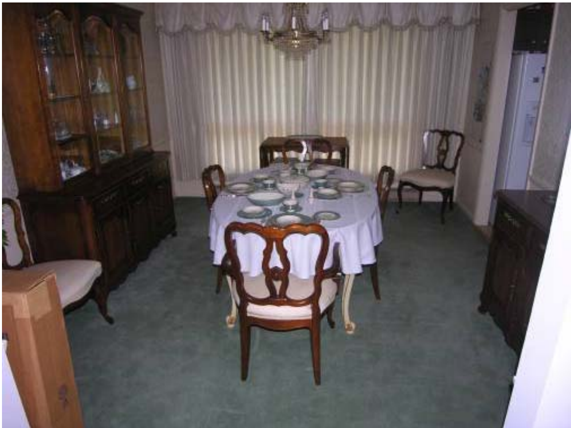
DINING ROOM – 13' X 11'6"

ENSMINGER AUCTIONEERS – Since 1836 – PA Lic.#RY-160-L – 717-652-4111