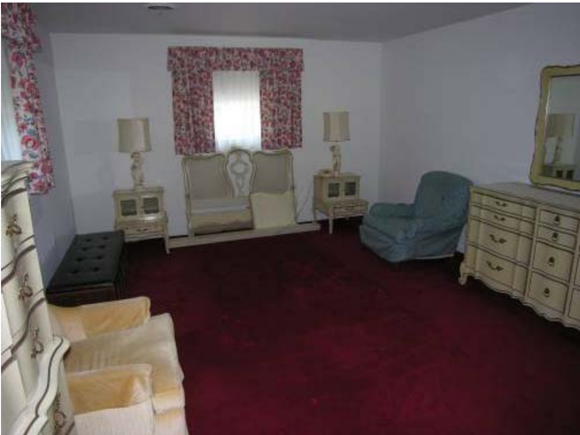
MASTER BEDROOM – 13'4" X 18'9"

ENSMINGER AUCTIONEERS – Since 1836 – PA Lic.#RY-160-L – 717-652-4111