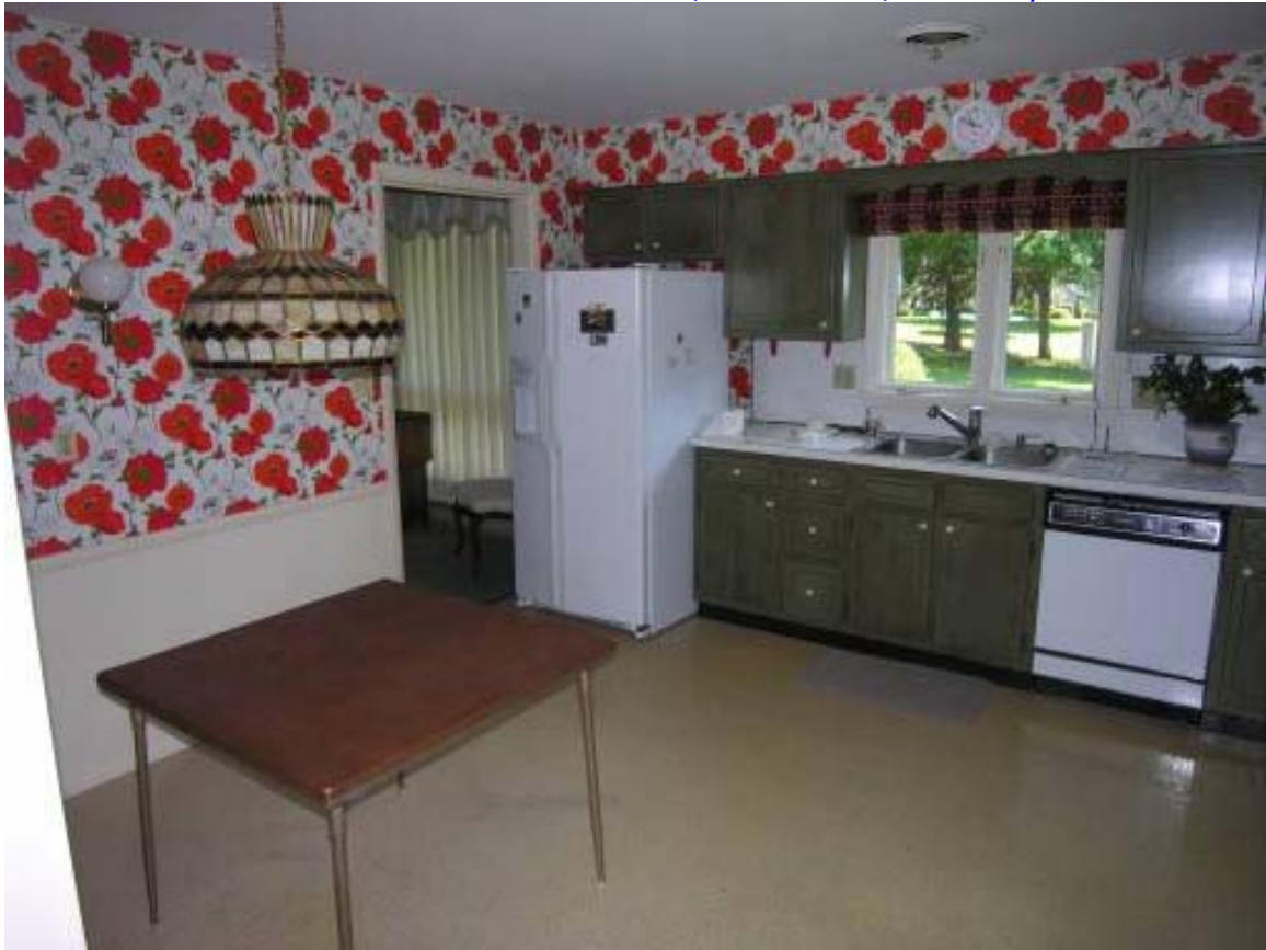
KITCHEN – 13' X 12'10"

REAL ESTATE AUCTION – 302 FIRESIDE DR., CAMP HILL, PA – July 30 th - Noon