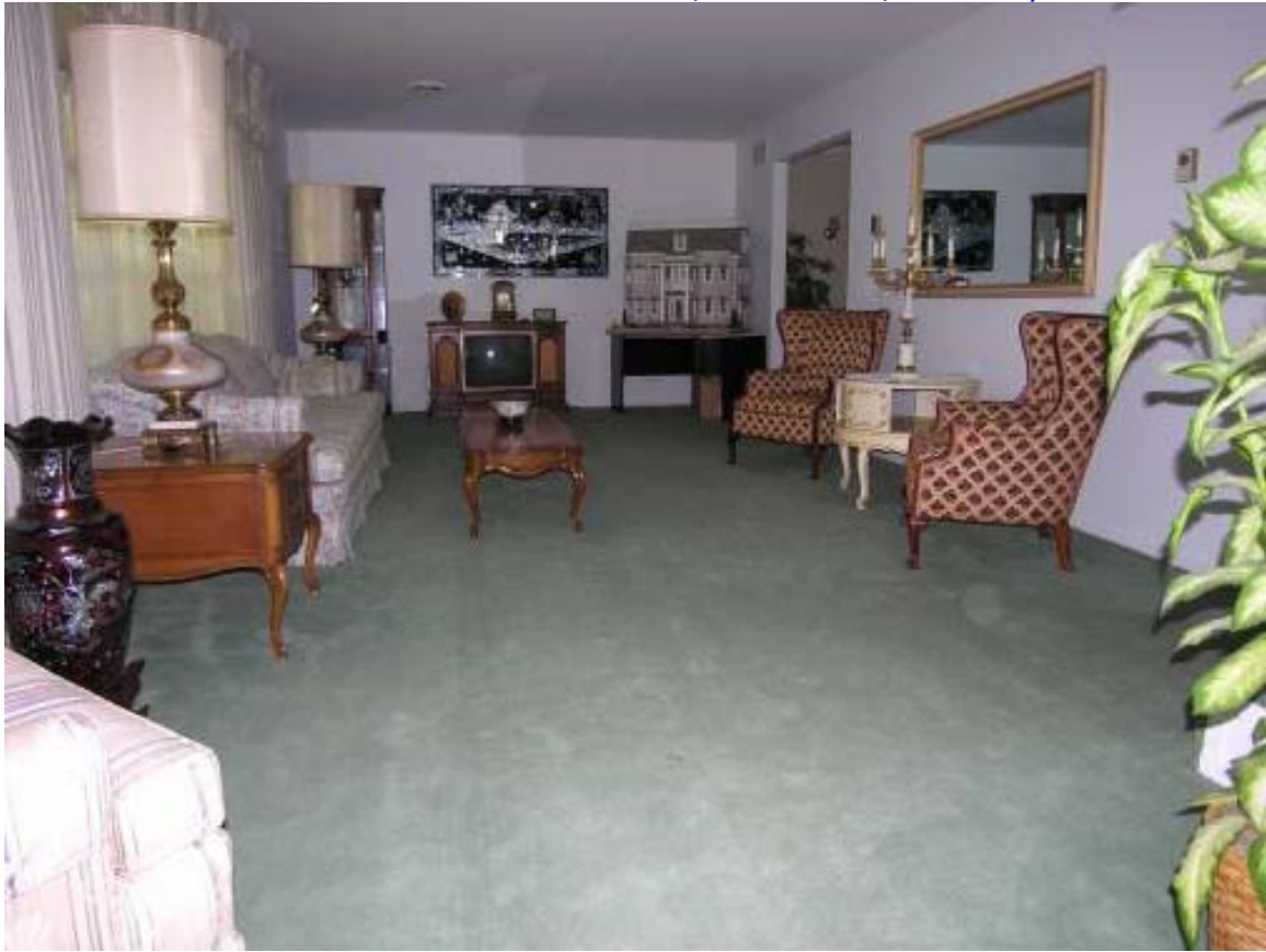
LIVING ROOM – 13' X 25'4"

REAL ESTATE AUCTION – 302 FIRESIDE DR., CAMP HILL, PA – July 30 th - Noon